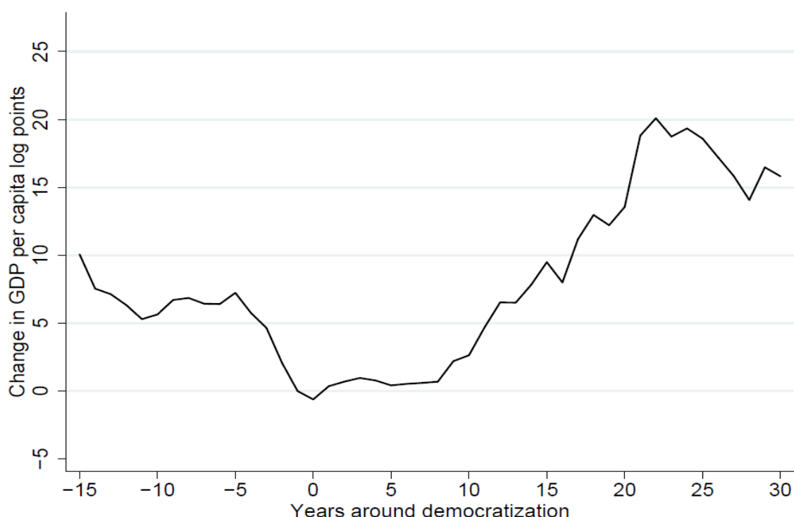
Figure 2: GDP per capita around a democratization.

arguments for causality have been made in both directions. Lipset (1959) famously offered his “modernization” hypothesis according to which rising levels of income would lead to democratization. More recently, Acemoglu et al. (2015) have argued that democratization leads to growth. Figure 2 shows the association estimated in their paper on the evolution of GDP per capita around democratization events.