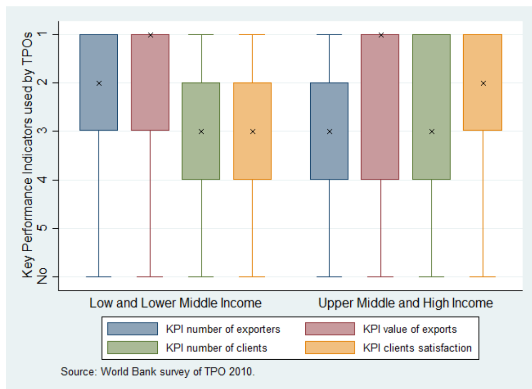
Figure 2: Distribution of TPO measures of performance by Key Performance Indicator